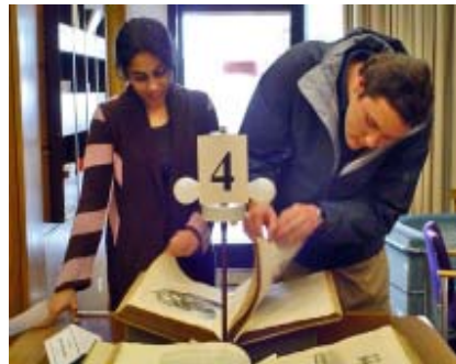
Students examining Haller and Bidloo